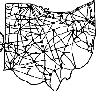
Figure 5. Railroad lines of Ohio, U.S.A.

At the 1961 session of the International Astronautical Federation, Webb presented plans for large colonies on Mars. Huge conduits would bring water vapor from the polar ice caps as they melted in summer. This would be condensed into water and stored for use by colonists in pressured cities and to irrigate crops in low-pressure plastic greenhouses. Moisture-laden air, enriched by oxygen from plants, would be forced great distances without power; this would be done by using control-gates adjusted to the daily expansion and nightly contraction of the air from temperature changes. Such a system, with conduits a mile or more wide, would connect all the Colony settlements and extend from pole to pole.